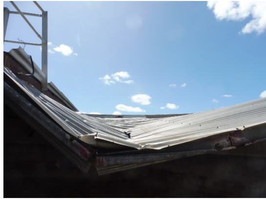
Sever corrosion on roof members or sub-standard light gauge components