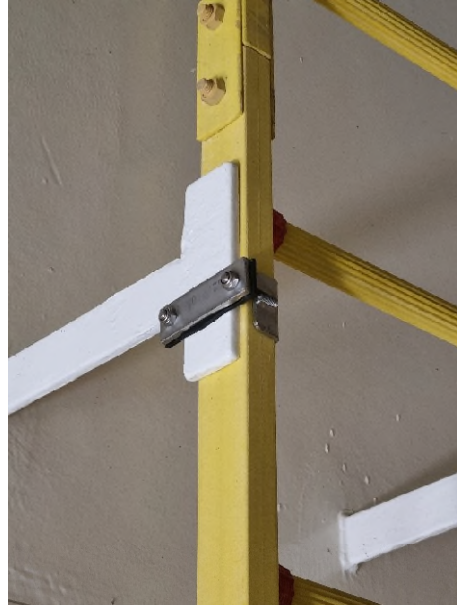
New internal replacement coating system