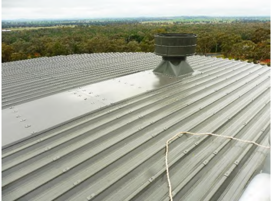
Completed overcoating external